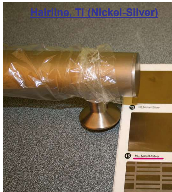
Hairline, Ti (Nickel-Silver)