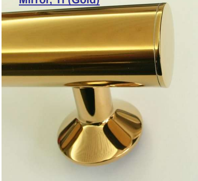
Mirror, Ti (Gold)